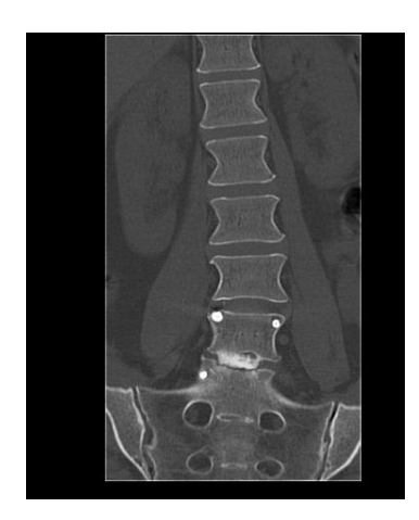
Figure 2. CT study showing incomplete arthrodesis at 18 months postoperative.