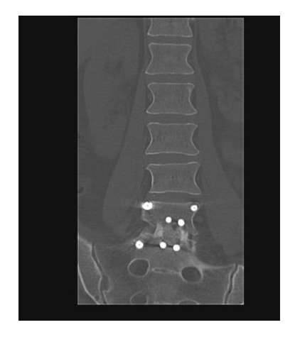
Figure 3. Postoperative CT study conducted one year following original surgery demonstrated evidence of a complete anterior and posterior fusion.

The patient was able to return to normal function, including day-to-day activities, exercise, and full-time employment. She was able to return to aerobic activities, including swimming and walking 3 miles daily.