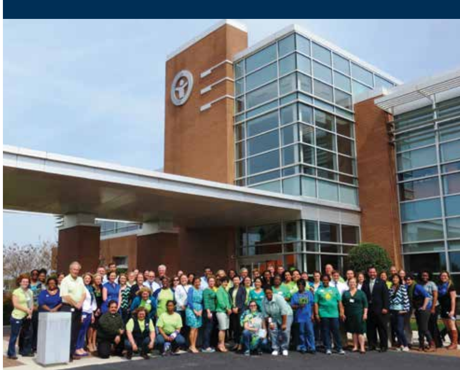
LifeNet Health employees on National Donate Life® Blue & Green Day