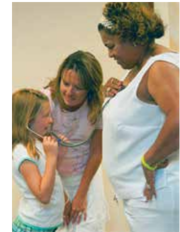
A donor's daughter listening to her father's heartbeat, now in a grateful recipient.

Our Donor Family Services program is an expression of that purpose. The program is staffed by bereavement specialists dedicated to honoring donors and their families through ongoing support that promotes peace and healing. Our Thanks 2 You program enables implant recipients to contact their tissue donor family to thank them for their loved one's gift. In addition to individual family communication and online resources, LifeNet Health hosts several events and workshops throughout the year to aid in the healing process and provide a meaningful way for families to celebrate the gift of life.