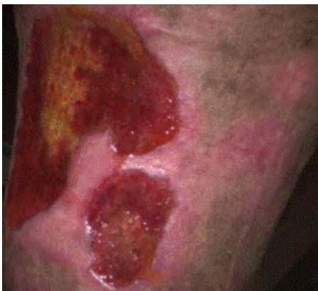
6.6cm 2 preoperative venous leg ulcer after debridement