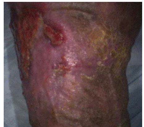
Complete healing 11 weeks after one application of Dermacell AWM