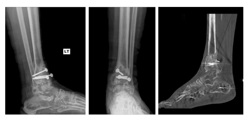
Figure 3. Radiograph and CT images showed consolidation of metaphyseal Vivigen Formable bone graft at four months post-operative.