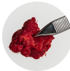
Moldable upon rehydration