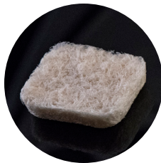
100% bone fibers

*Findings from an animal-based model are not necessarily predictive of human clinical results.