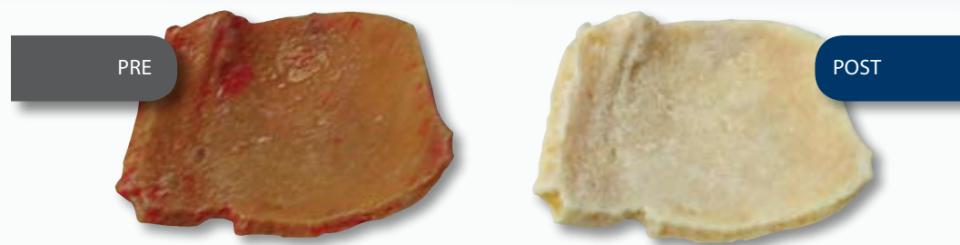
Autograft cranial bone flap before (left) and after (right) OsteoCleanse™.

OsteoCleanse is the first and only process of its kind specifically designed for autologous tissue. Based on the patented and proven Allowash® technologies, OsteoCleanse offers a safe and effective alternative to current methods of handling autologous tissue.